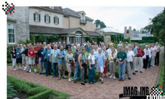
BIOCOMM 2008 Rochester, NY Group Photo by Sue Loomis